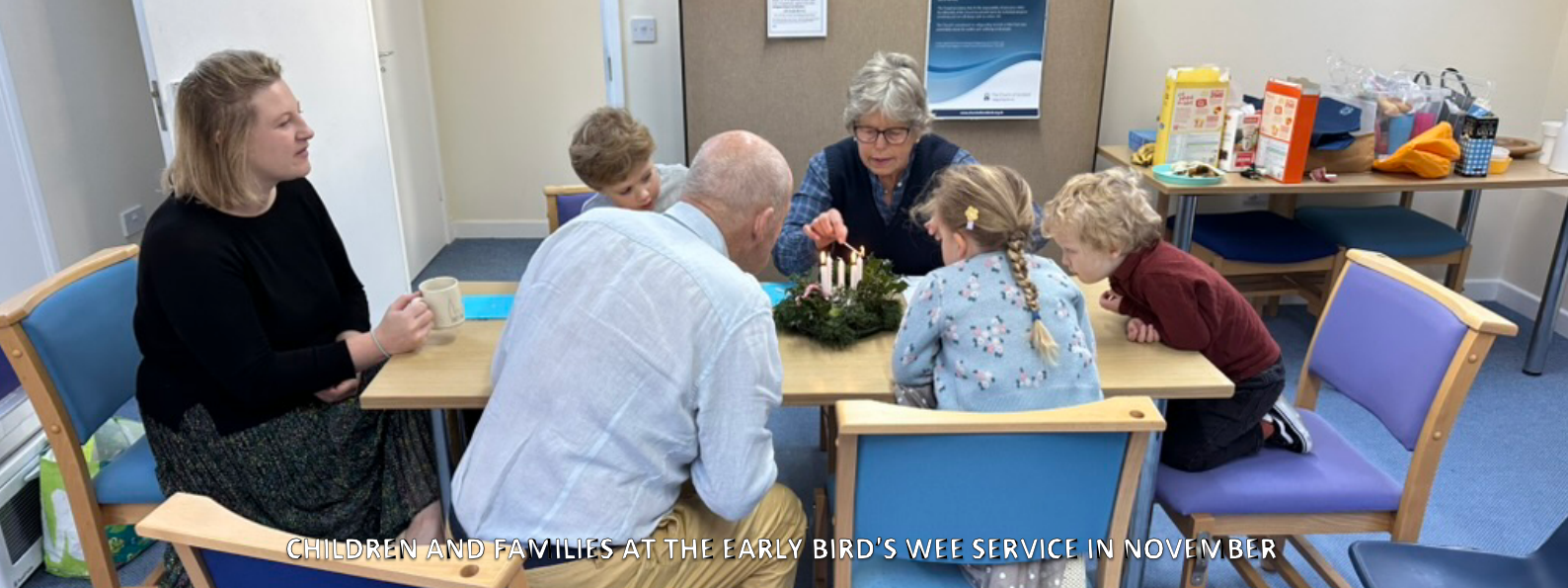
CHILDREN AND FAMILIES AT THE EARLY BIRD'S WEE SERVICE IN NOVEMBER